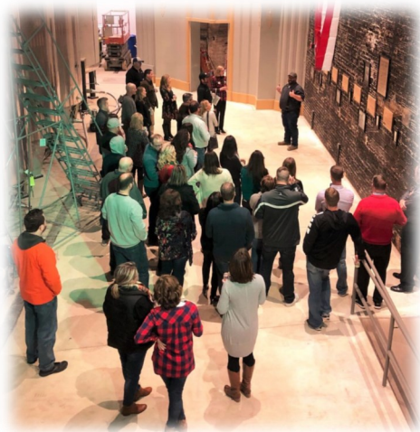
Kennay Farms Distillery offers regular tours of the facility.