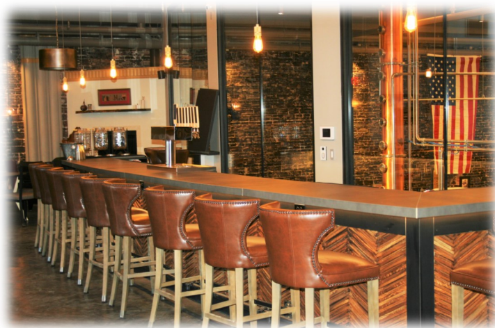
Kennay Farms Distillery is open to the public.