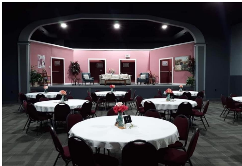
The house and stage during "Four Old

A fter three years of renovation, VCCT is very excited that the new Lincoln Arts Center is finally open and operational! Under the direction of master carpenter Steve Frank, a host of volunteers worked tirelessly, giving up many weekends and even some weekdays, to turn an old abandoned elementary school into a beautiful theater venue complete with a proscenium stage, a full lobby, a multi-purpose room, and a green room (the room